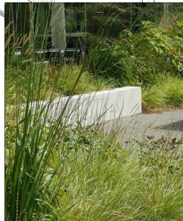
Seating with buffer planting