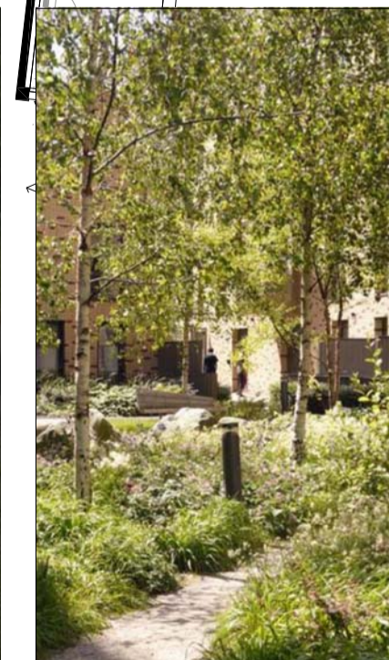
Group tree planting