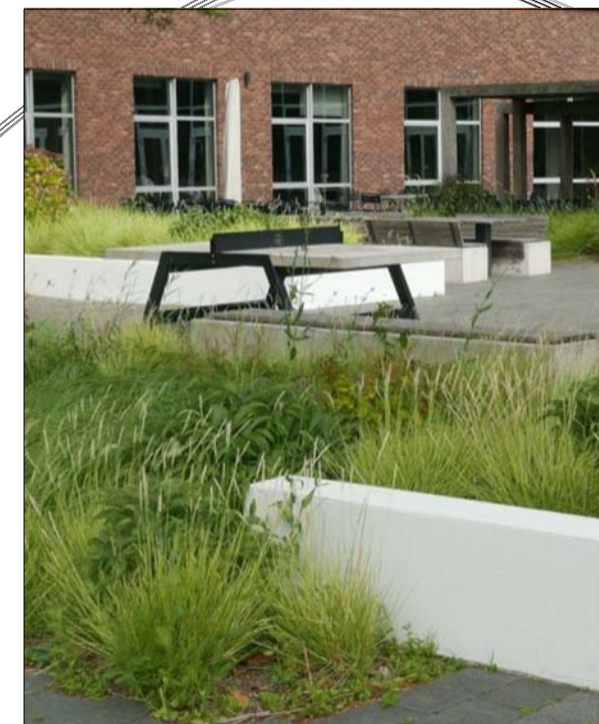
Potential amenity provision