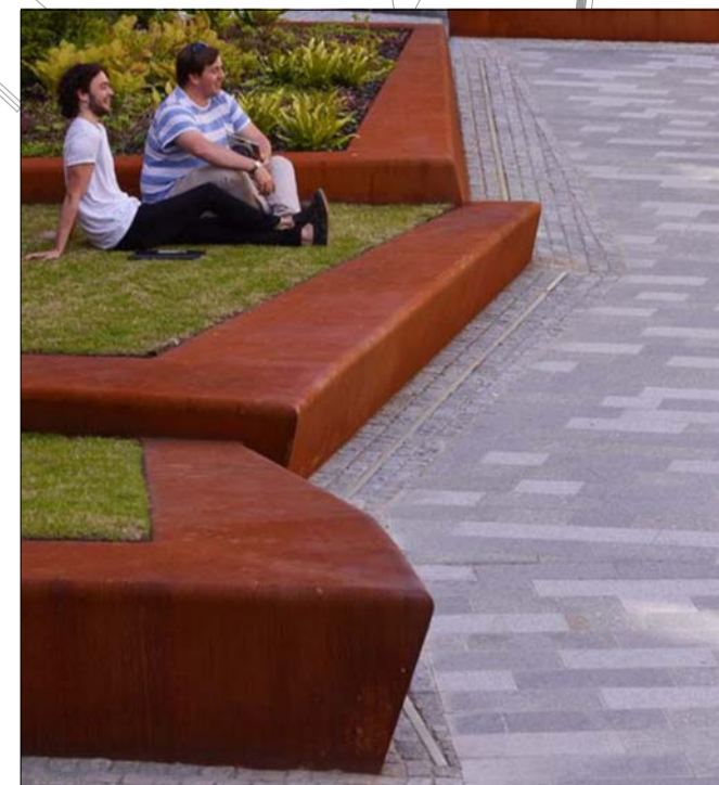
Seating with lawn areas