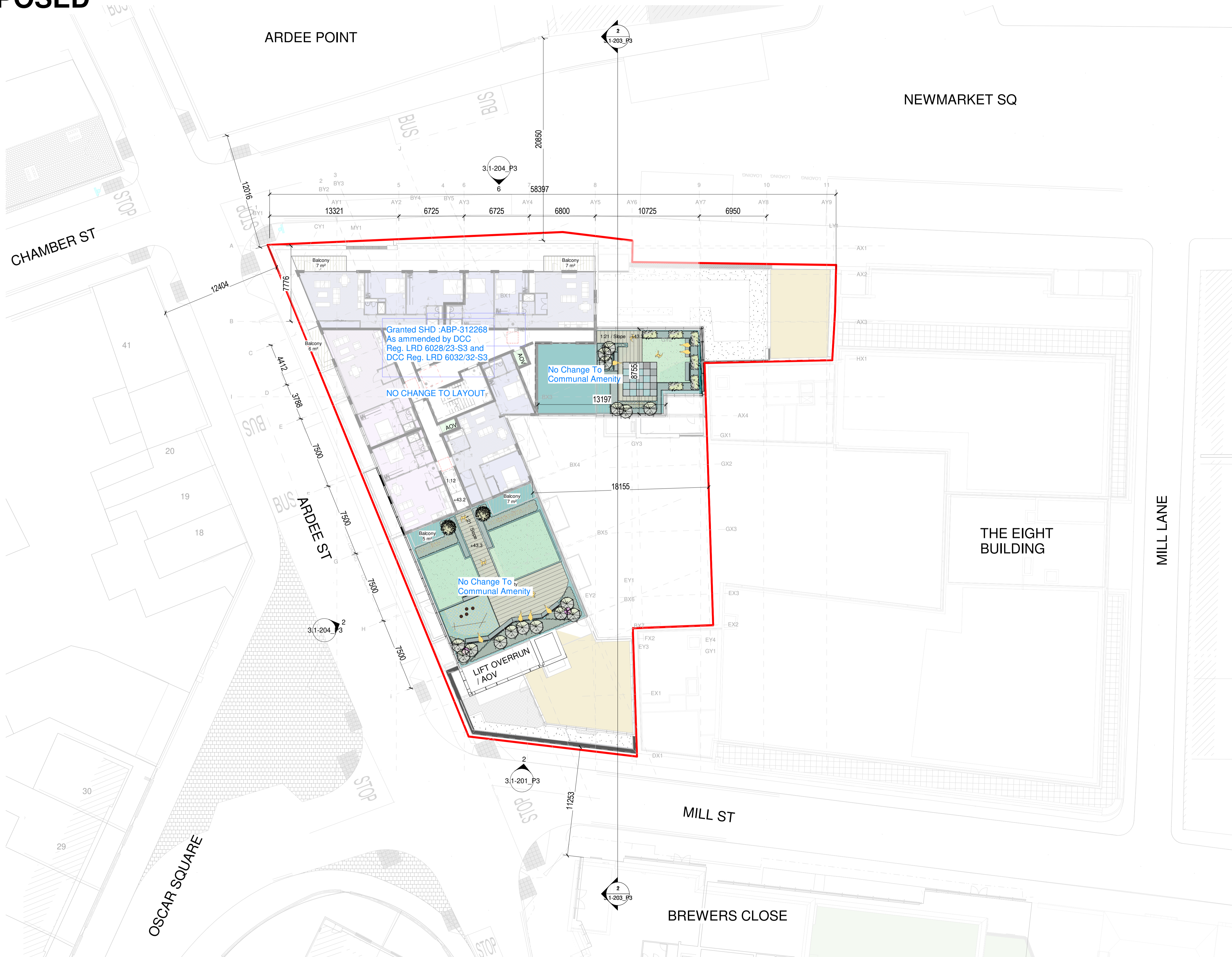
9th Floor Plan - Proposed 1 : 200

Notes: DO NOT SCALE FROM THIS DRAWING. USE FIGURED DIMENSIONS IN ALL CASES. VERIFY DIMENSIONS ON SITE AND REPORT ANY DISCREPANCIES TO THE ARCHITECTS IMMEDIATELY. THIS DRAWING IS TO BE READ IN CONJUNCTION WITH THE ARCHITECTS SPECIFICATION. © THIS DRAWING IS COPYRIGHT AND MAY ONLY BE REPRODUCED WITH THE ARCHITECTS PERMISSION.