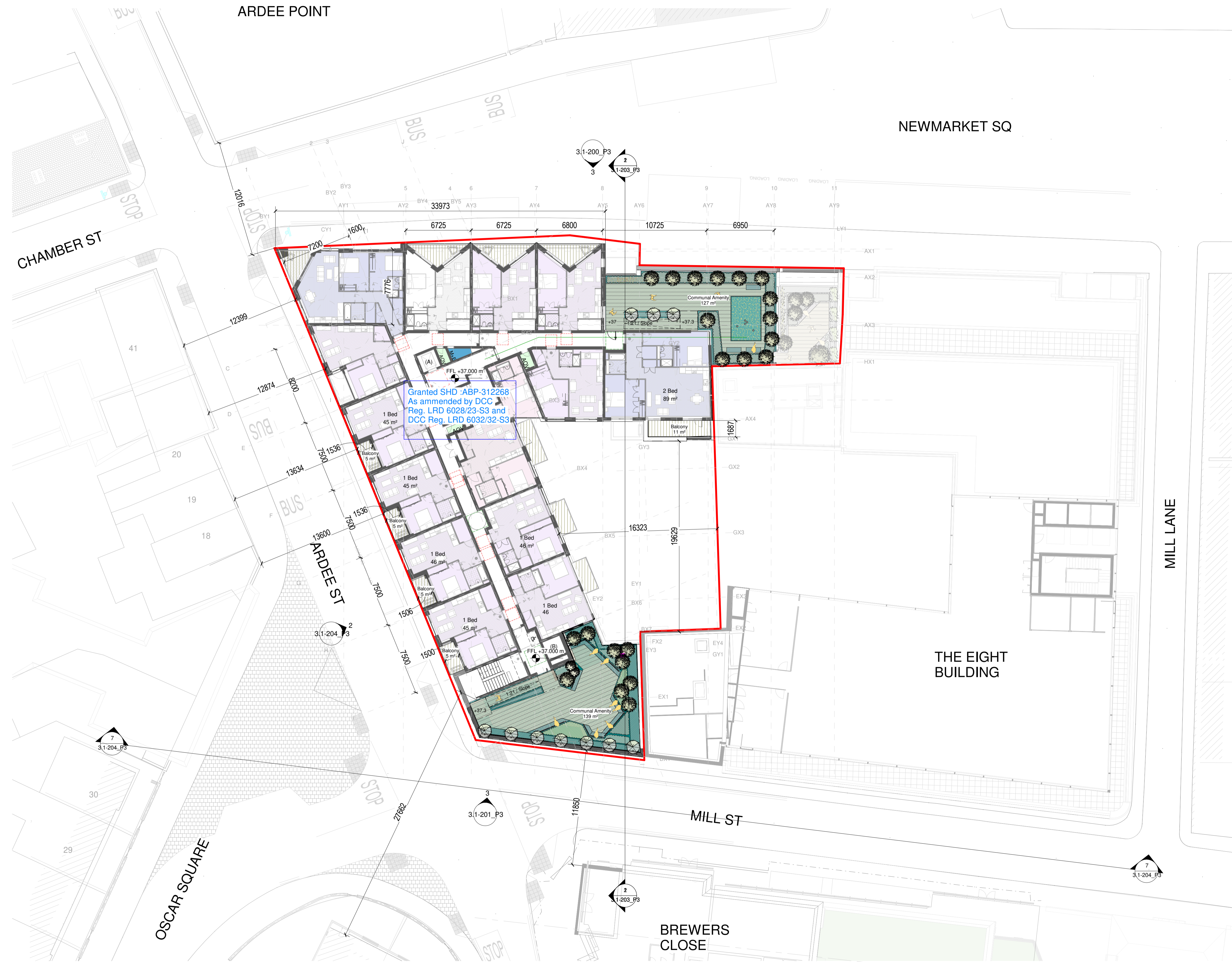
7th Floor Plan - Permitted 1:200

Notes: DO NOT SCALE FROM THIS DRAWING. USE FIGURED DIMENSIONS IN ALL CASES. VERIFY DIMENSIONS ON SITE AND REPORT ANY DISCREPANCIES TO THE ARCHITECTS IMMEDIATELY. THIS DRAWING IS TO BE READ IN CONJUNCTION WITH THE ARCHITECTS SPECIFICATION. © THIS DRAWING IS COPYRIGHT AND MAY ONLY BE REPRODUCED WITH THE ARCHITECTS PERMISSION.